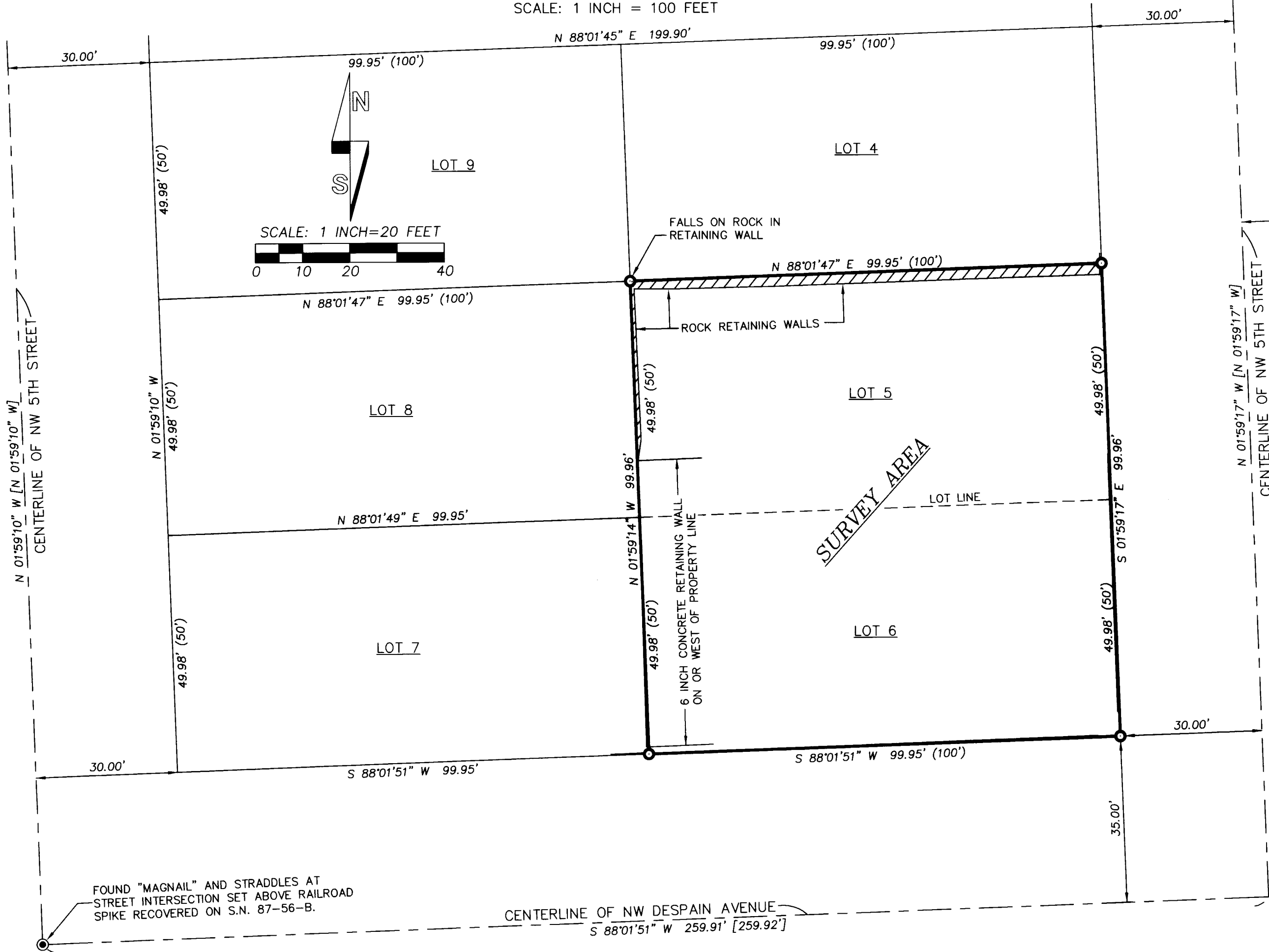
SCALE: 1 INCH=20 FEET